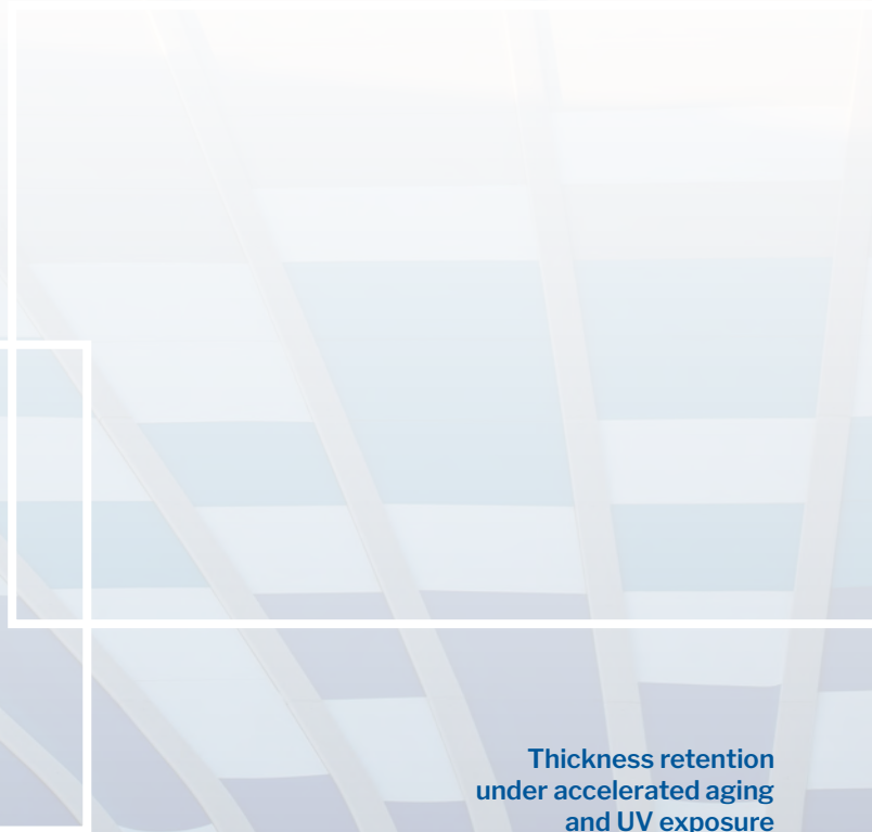
Thickness retention under accelerated aging and UV exposure

Lot-to-lot color reproducibility is controlled to a delta of <math><0.5</math>, providing consistent aesthetics. Seaman Corporation offers a range of colors for the entire line of Shelter-Rite® Architectural Products.